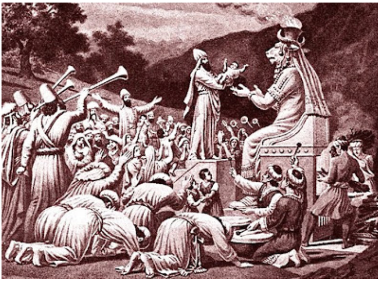
Children being offered to Molech the pagan god of the Ammonites

“And I looked and turned to another part of the earth and saw there a deep valley with burning fire. And they brought the kings and the mighty and put them into this deep valley.” (Book of Enoch 54:1,2)