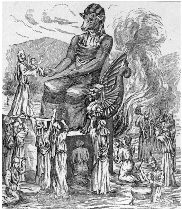
Children burned alive in the Valley of Hinnom in worship to Molech

associated with devil and demons — Matt 25:41